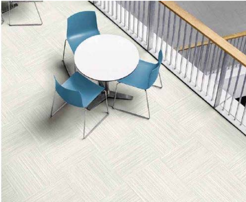
Fig1 Image of product